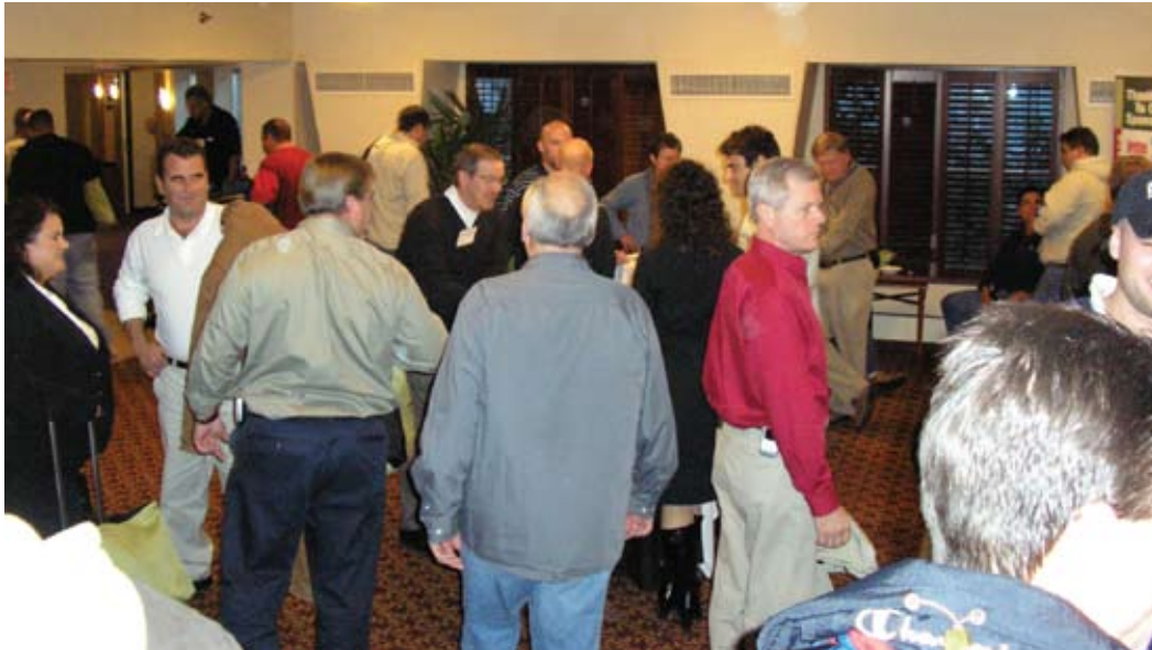
Following each workshop, a Networking Reception allows the attendees to interact with the speakers as well as with other fabricators. Moreover, the Clinic sponsors on hand are available to discuss industry issues and needs with those in attendance.

— have praised the speakers for their insight and practical knowledge.