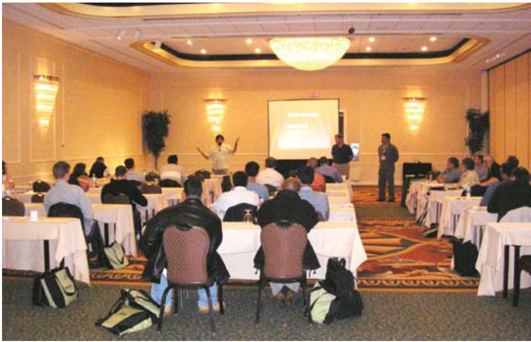
Time is also dedicated for a question-and-answer session where attendees can raise additional points for the speakers as well as their fellow fabricators.